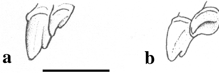
FIGURE 4. Frontal view of left upper incisors of (A) Glischropus bucephalus n. sp. (holotype, HNHM 2006.34.49., from Cambodia) (B) G. tylopus (BM(NH) 10.4.5.68, from Borneo). Scale = 1 mm.