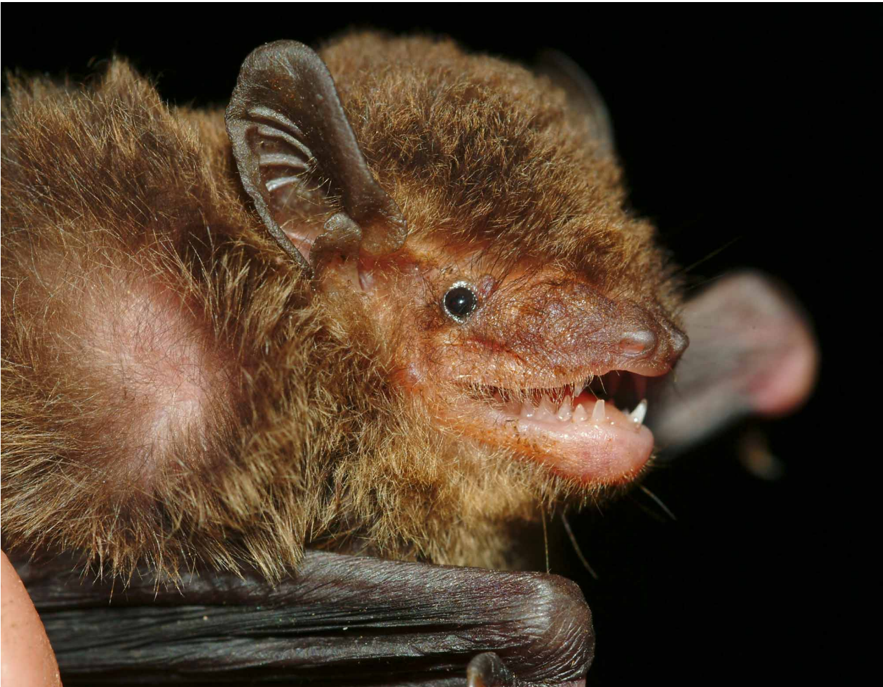
FIGURE 1. Portrait of a living specimen of Glischropus bucephalus n. sp. (paratype, HNHM 2006.34.37., from Cambodia).

Description. Forearm length above 32 mm (Table 1); ears moderate in size, rounded and dark colored; tragus relatively narrow, broadly rounded and angled slightly forward, typically Pipistrellus -like (Fig. 1). The fur is rather long and dark brown without banding above and ventrally, individual hairs are dark brown basally, with the upper third a lighter, yellowish brown. The plagiopatagium is attached to the base of the toe and the calcar has a well-developed lobe supported by a central cartilage. The thumb has a large pinkish pad, which is oval in outline and ca. 3 mm in length. The sole of the foot is thickened and unpigmented.